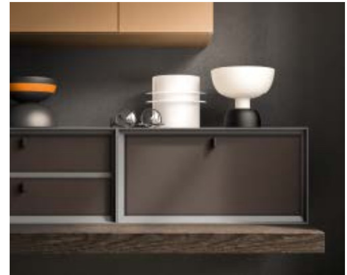
Box interno per pensile Cube / Internal storage box for Cube wall unit