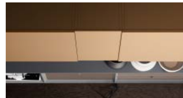
Anta Sp. 1,4 cm / Door Th. 1.4 cm