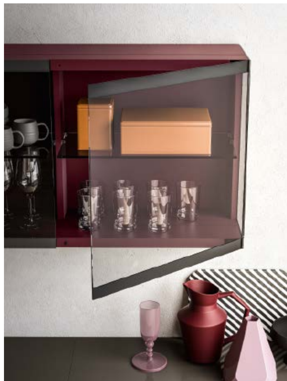
Day comp. 30 ..... L256 P52,7 H148 Basi finite sospese laccato lucido Fango / Suspended finished base units lacquered in high-gloss Fango Pensile Ghost laccato opaco Azalea e vetro trasparente grigio con serigrafia opaco Piombo / Ghost wall unit lacquered in matt Azalea and clear grey glass with matt Piombo screen-printing