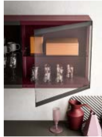
Pensile Ghost / Ghost wall unit

Четыре новых элемента с функциональными и эстетическими решениями расширяют гамму композиционных предложений все более укомплектованной системы.