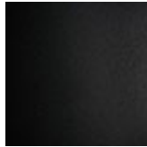
GFM73 black embossed