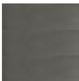
OP0 transparent varnished