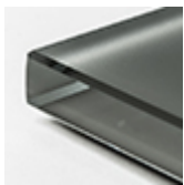
extra clear graphite