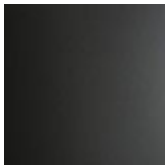
OP69 matt graphite