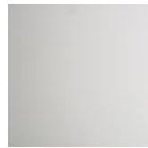
OP71 matt white