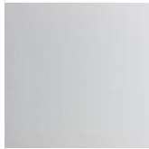
GFM71 white embossed