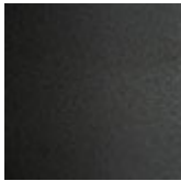
GFM69 graphite embossed