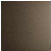
GFM11 titanium embossed