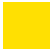
OP86 matt yellow