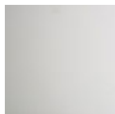
OP71 matt white