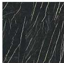
Mat ceramic Laurent