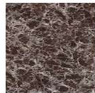
Glossy ceramic Rosso imperiale