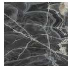
Glossy ceramic Black Onyx