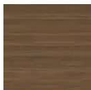
Veneered wood Walnut Canaletto