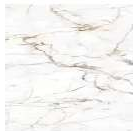
Silk finish ceramic Calacatta macchia vecchia