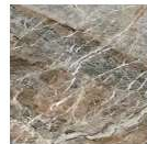
Glossy ceramic Mountain peak